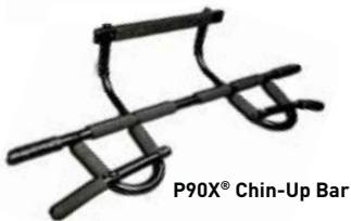
P90X® Chin-Up Bar