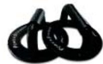
Tony Horton's PowerStands®