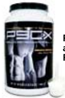
P90X® Results and Recovery Formula®