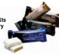
P90X® Peak Performance Protein Bars