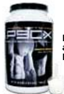
P90X® Results and Recovery Formula®