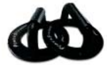
Tony Horton's PowerStands®