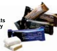
P90X® Peak Performance Protein Bars