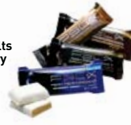
P90X® Peak Performance Protein Bars