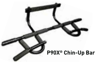
P90X® Chin-Up Bar

Use these recommended items with P90X2™. To order, visit Beachbody.com .