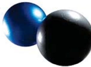
Premium Stability Ball