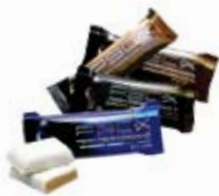
P90X® Peak Performance Protein Bars

Use these recommended items with P90X2™. To order, visit Beachbody.com .